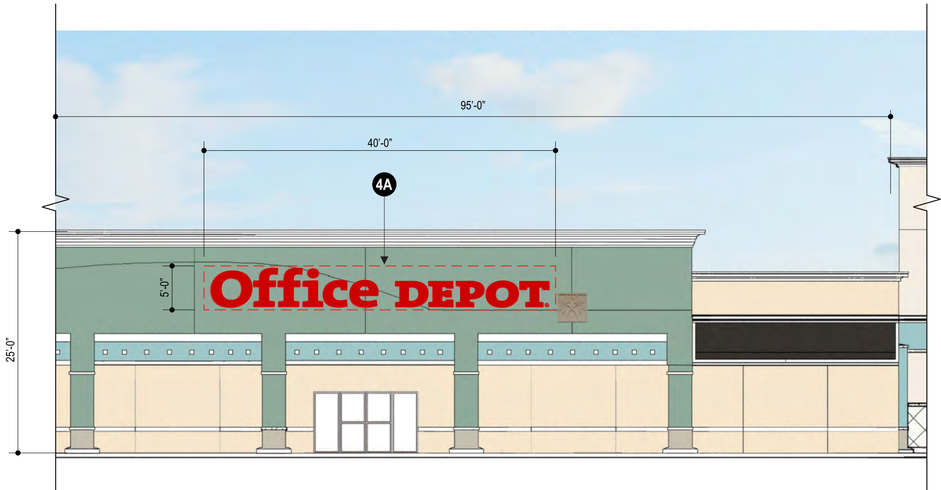
4A SOUTH EXTERIOR ELEVATION SCALE: 3/32" = 1'-0"